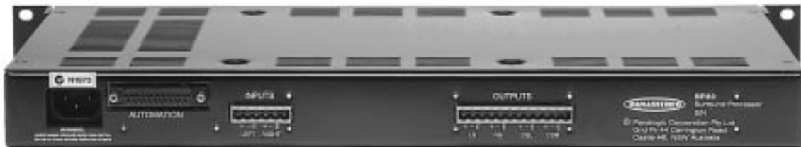
SP23 Rear Panel

Connect the cable shield to the “E” terminal of each SP23 input only. Do not connect the shields at the amplifier.