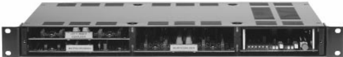
SP23-10 (Octave Equalisers) card positions

In the event of a failure of the unit, it can be bypassed by pressing the red BYPASS button at the right front of the unit. This button is NOT a power switch but simply allows the left and right surround channels from the processor to be sent directly to the left and right surround power amplifiers. There is no rear surround in bypass mode.